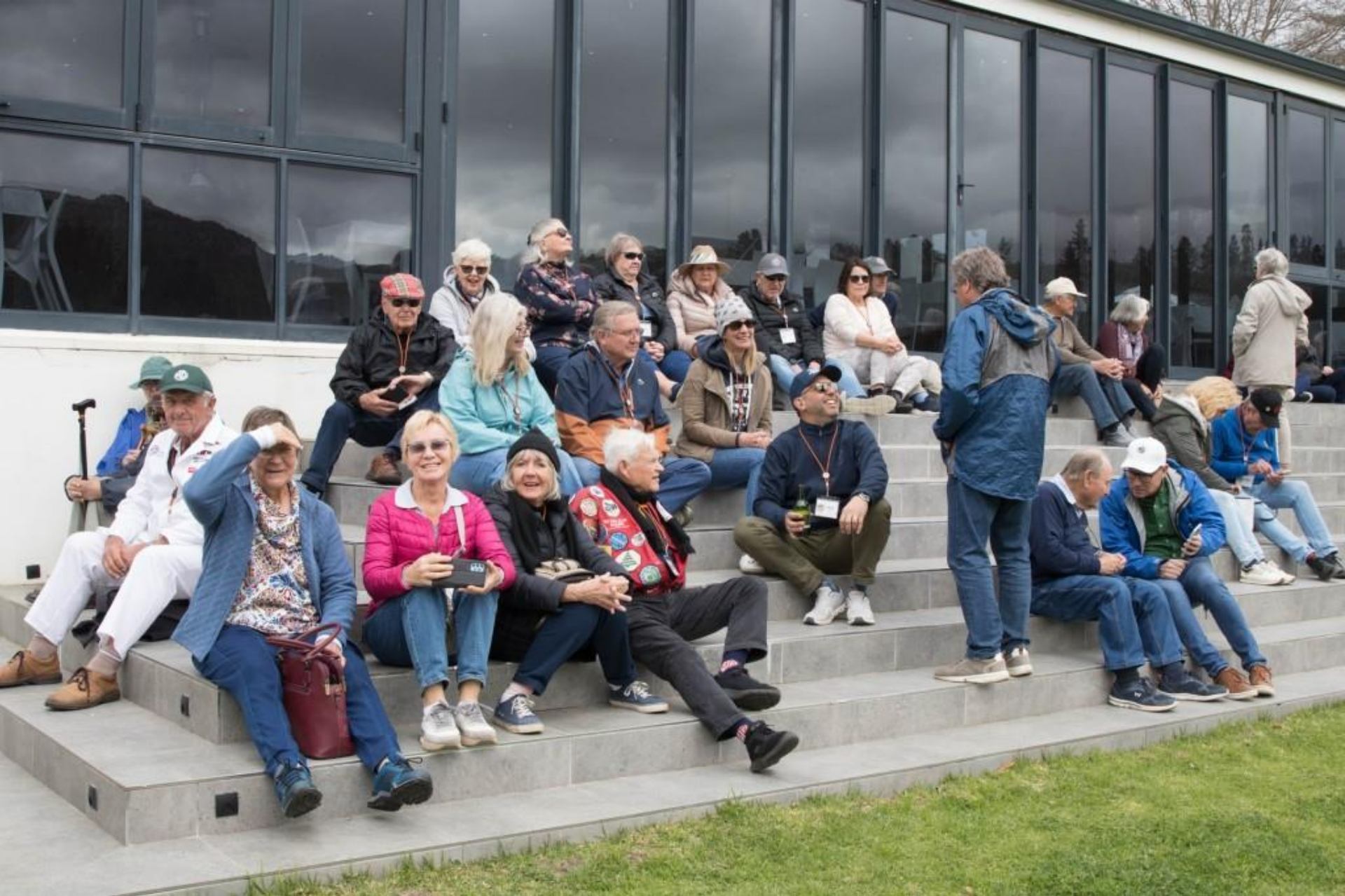
Everyone was in fine form the whole time – what a happy, pleasant bunch