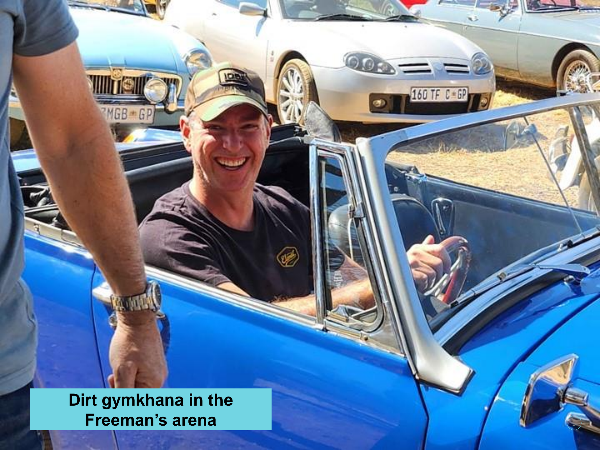
Dirt gymkhana in the Freeman's arena