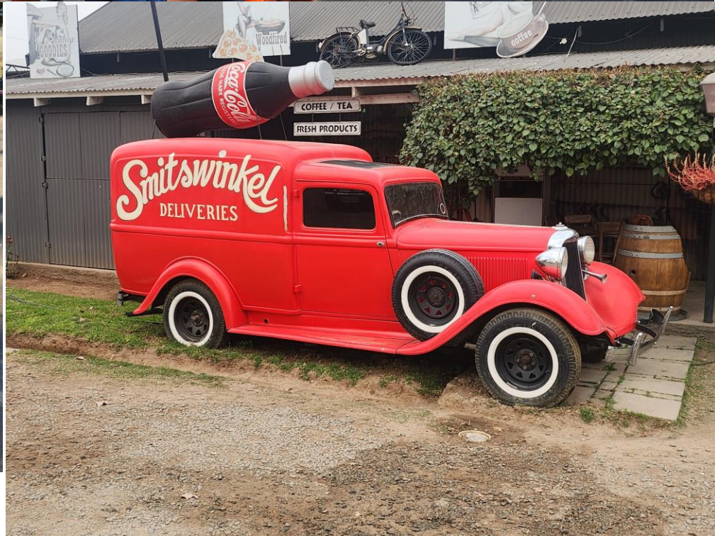
In and near Oudtshoorn