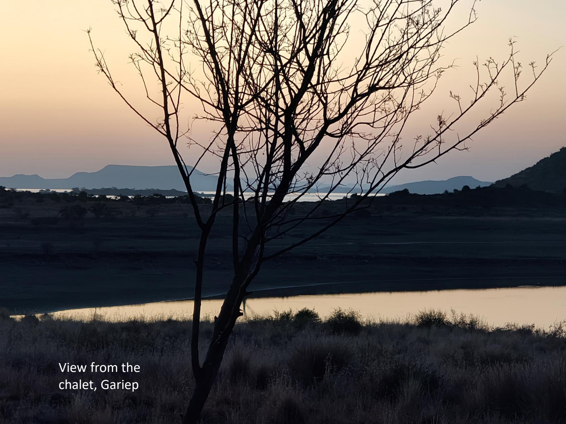
View from the chalet, Gariep