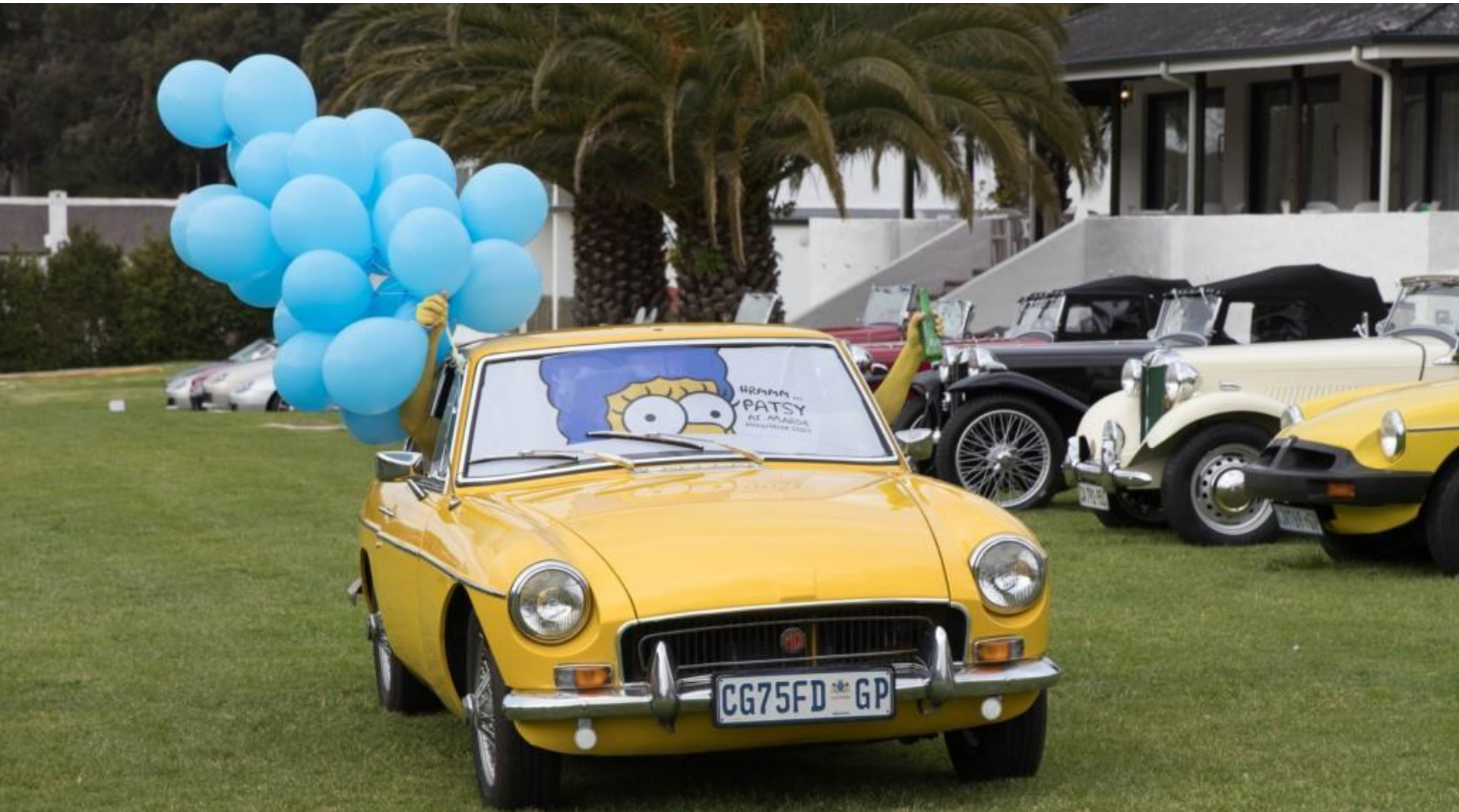
Comique – THE SIMPSONS!