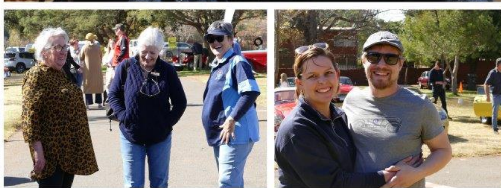
MGCC Combined Centres Show Day Sun 21st July '24 @ POMC