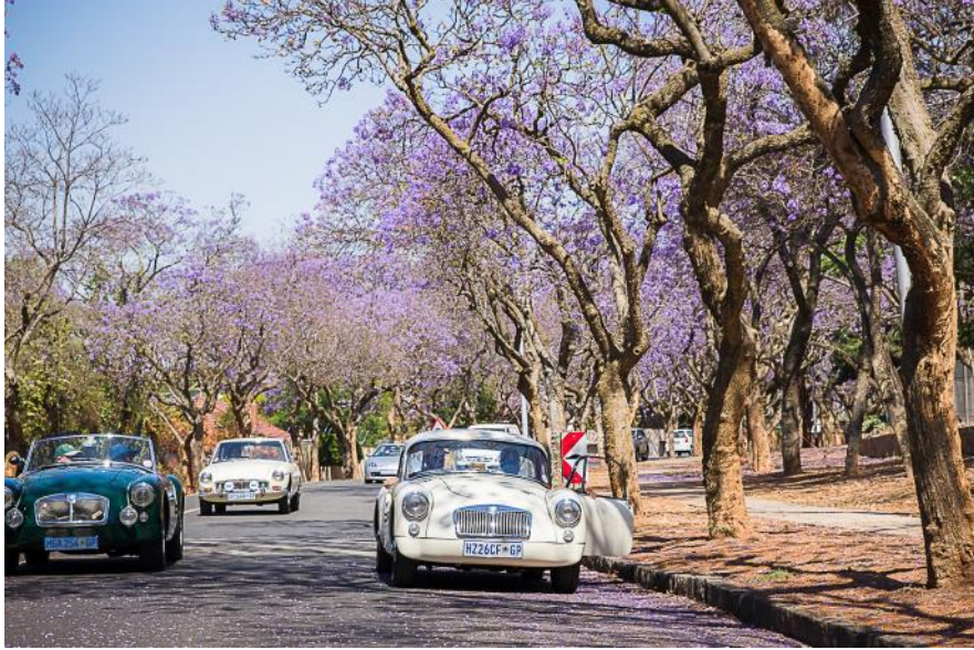
JACARANDA RUN 2019 20th October

A super warm day saw the annual Jacaranda Run start at union buildings and end at the MG Northern Centre Clubhouse. The 20th anniversary of the traditional run saw a new route being followed to explore some jacarandas located a little bit off the traditional addresses.