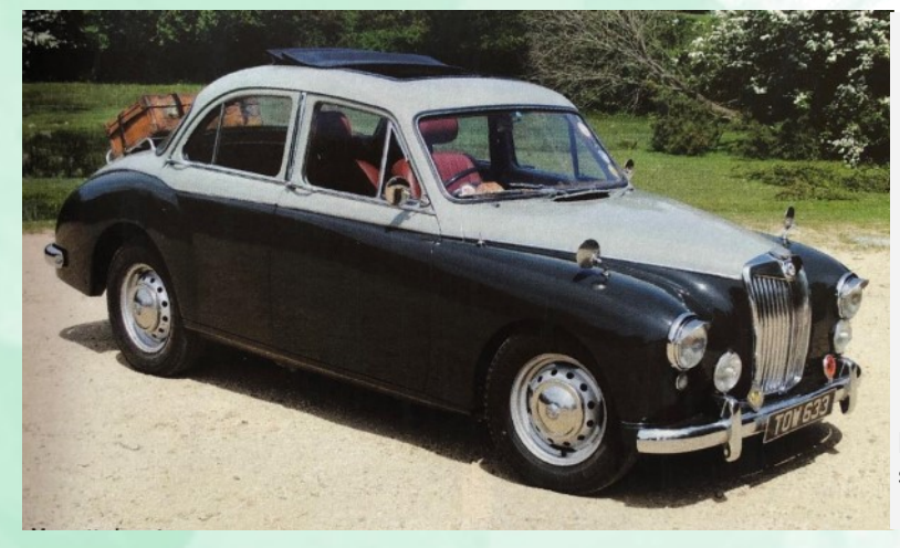
1957 MG Magnette £19,995 Boasts several touring upgrades, including leather suitcase

Track the market carefully—a totally rebuilt MGB complete with new heritage bodyshell for around ten grand is cracking value. And looking at today's market, finding one shouldn't be hard.