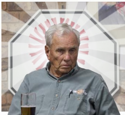
Patron Saint of the Icicle Rally