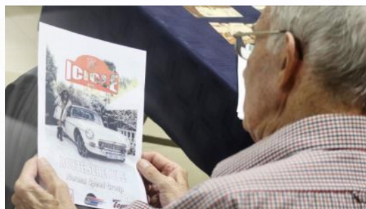
Icicle Rally route Schedule 2002