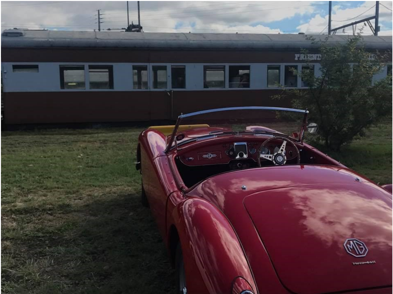
MGA and Train, at the start of the Train Race