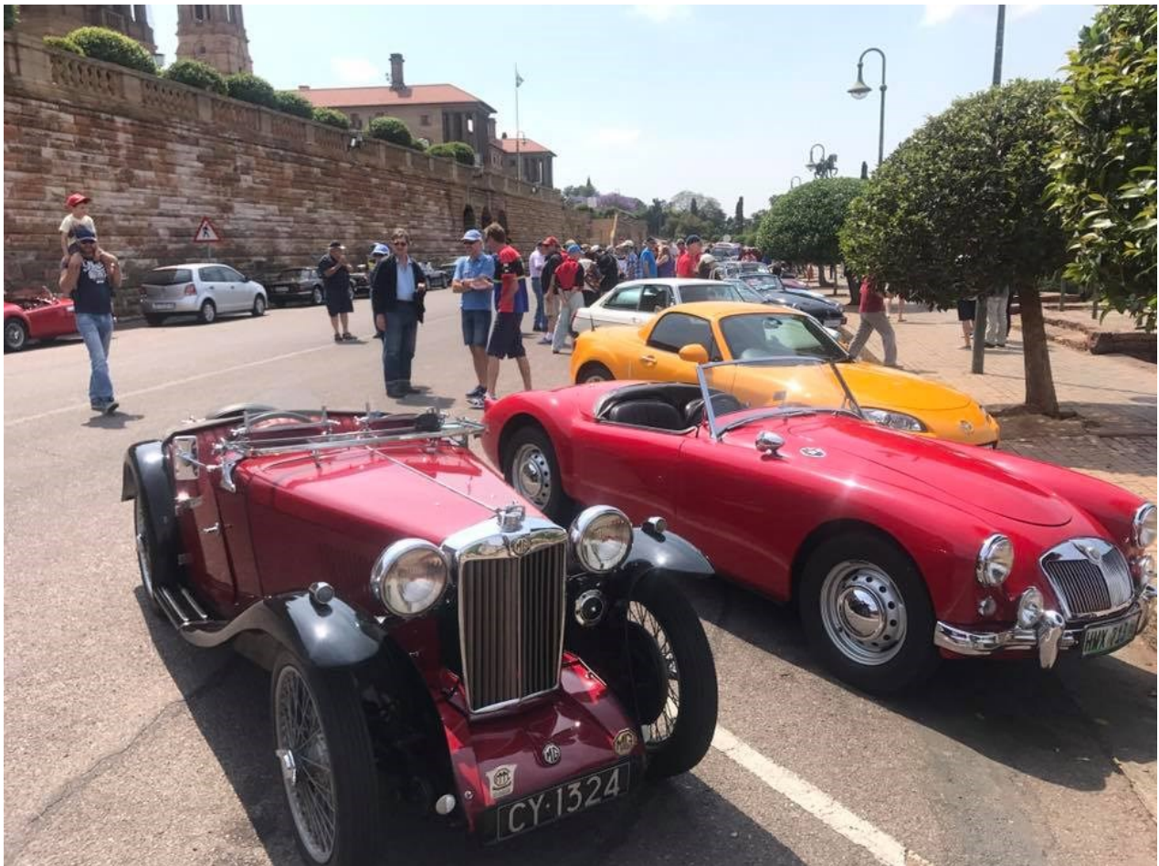
The start of the infamous Jacaranda Run in October.