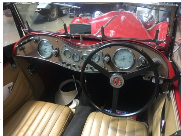
Interior of the MG TC at the "Oily Rag Run" in Cape Town. Not original, but lovely.