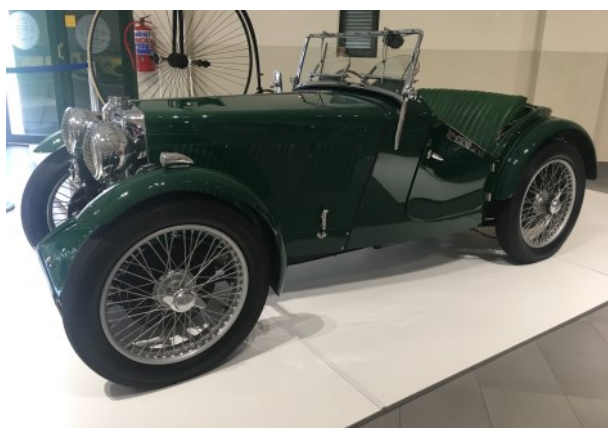
The FMM's MG J2, luckily on display when we visited.