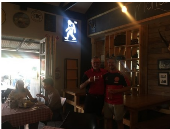
At Capital Craft. Note the “Mad Giant”