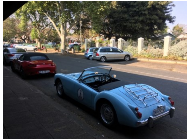
Our MGA and it's spiritual successor? Out and about on a Saturday morning.