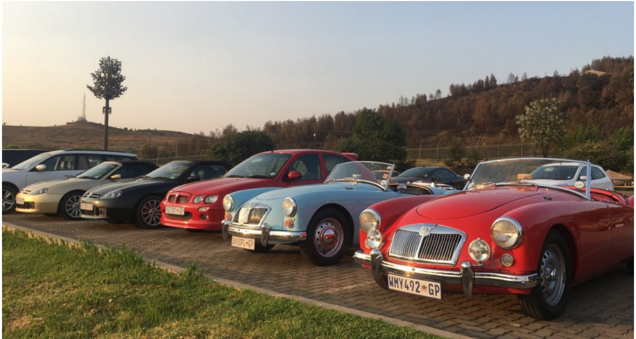
MG's at DK Burger on the September "Treasure Hunt" Run.