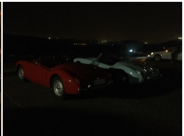
MGA's working the Night Shift after the run to DK Burger.