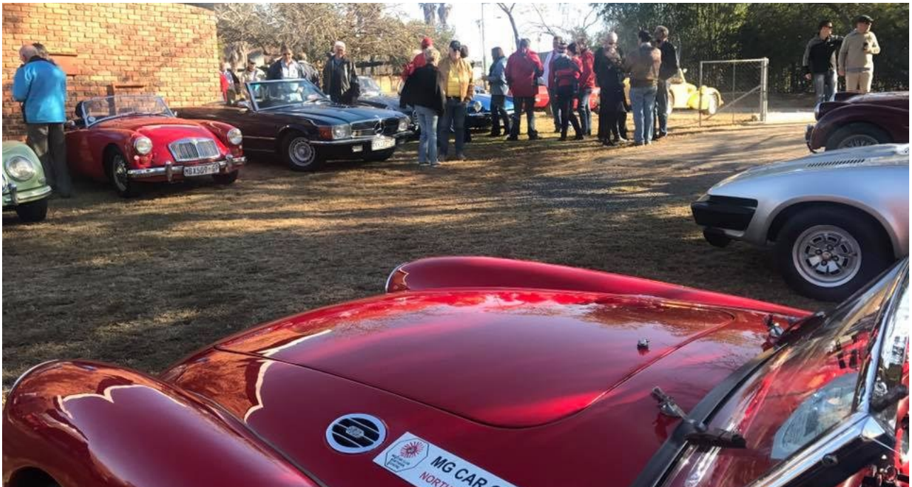
MG's at the off for the July Run