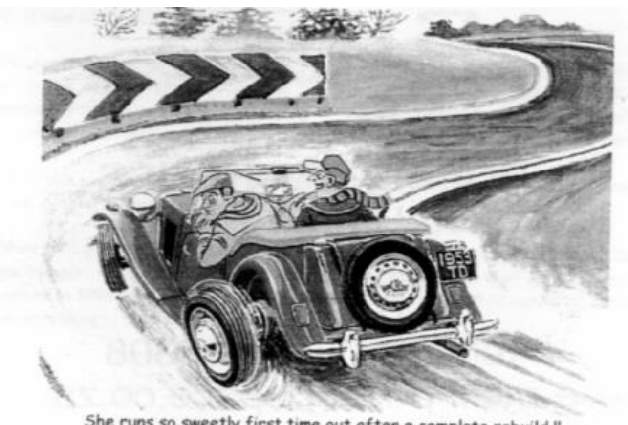
She runs so sweetly first time out after a complete rebuild!