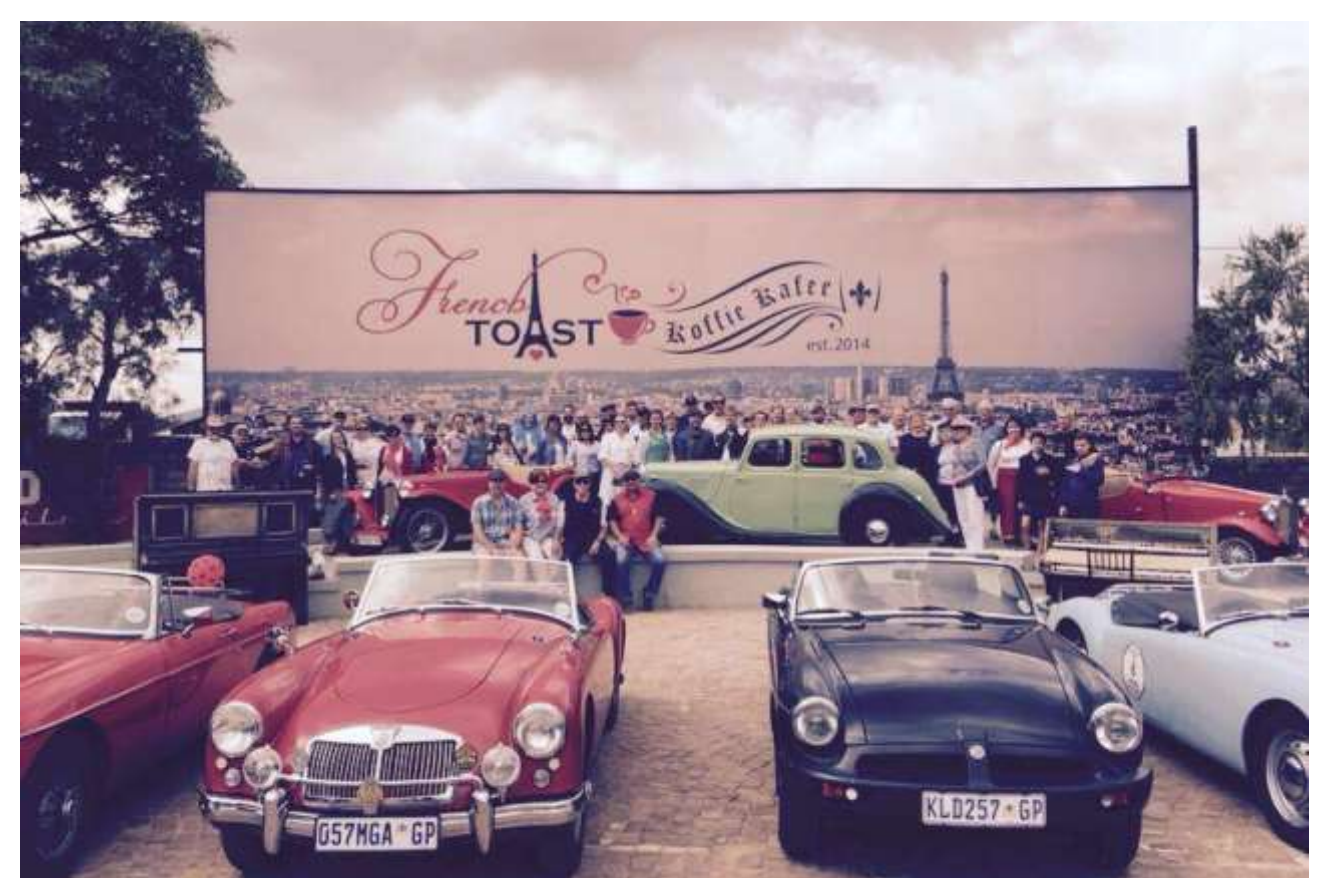
Members and Cars at French Toast as part of the March Run to Hartebeespoort