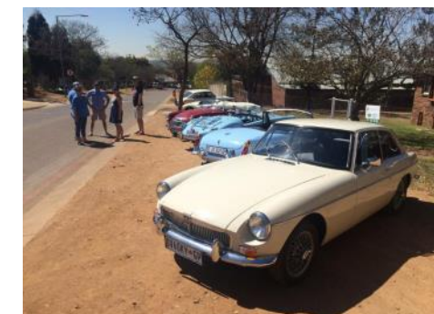
At the start of the run to Sunset Mountain