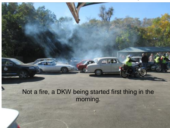
Not a fire, a DKW being started first thing in the morning.