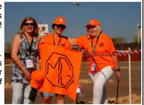
Some of the "Fairer" assistants at the Indaba

While much has been written about the Indaba in this newsletter, and in last month's issue I must mention once again how well our centre performed. As a committee we would like to thank everybody who participated, and put in some so much effort to make the event happen! Thank— you!