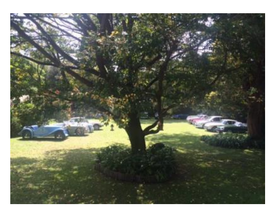
MG's in the Garden at Cecil Kimber's Birthday Party