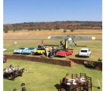
"Bird's Eye View" at Kitty Hawk