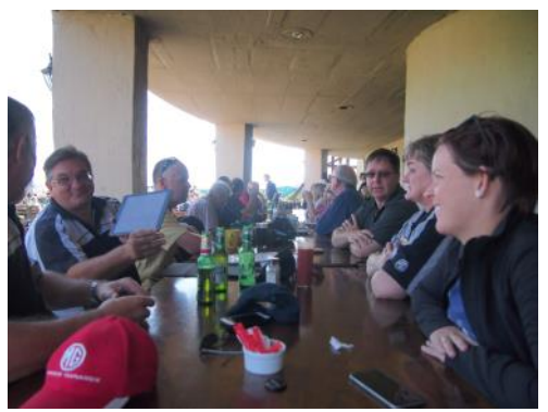
MG Enthusiasts & Club members at Kitty Hawk

The Condition Concour is a great opportunity to see the best cars which the club has to offer on display, and to have your car scored against other cars in the club. The event is of the "Tops Only" format which means that the cars are not judged on originality - but rather on Condition and Cleanliness along. Also, engine-bay and underbody are not judged so it is a very attainable form of concours. We hope to see you, and your clean car, there on the 22nd!