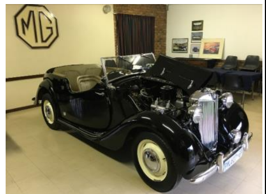
Dave Wheeler's Rare MG YT on display in the clubhouse. One of only 877 produced.