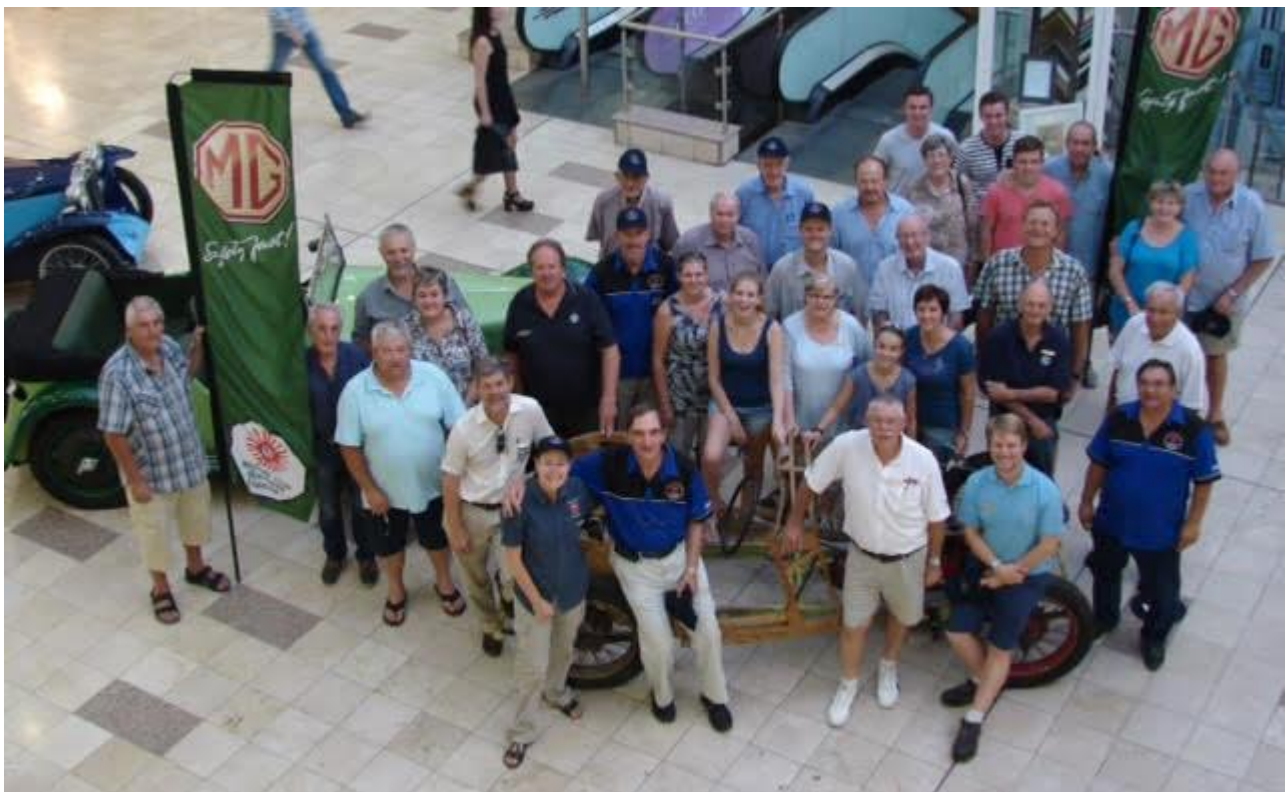
Members and Friends of the Club at the MG Timeline hosted by the Club at Brooklyn Mall on 20 and 21 February 2016