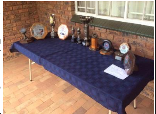
The Club Trophies—all engraved and ready to be awarded.