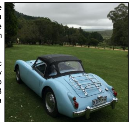
The 'A on a farm outside Dullstroom, making the journey part of the break.

As we head into the "mini-holidays", please drive safely and take care out there. Enjoy your MG - however you choose to do so!