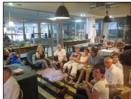
Socialising and relaxing after a busy day at the evening reception hosted by Brooklyn Mall.

The event has also been covered by the Pretoria Rekord. Their coverage may be found here: http://rekordeast.co.za/82964/classic-mg-cars-displayed-at-the-shopping-centre/