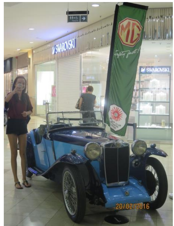
Pepi Gaspari's 1935 MG PA