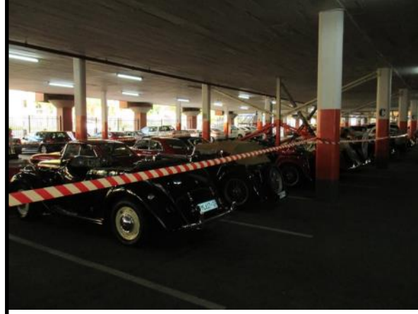
The Cars all arranged ahead of the "Drive-In" on Friday Evening.