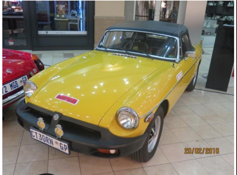
Claus Pille's MGB Roadster