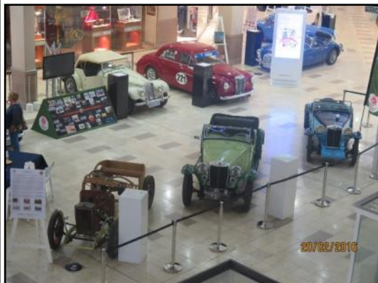
Some of the cars on display at the MG Timeline hosted at Brooklyn Mall.

As advertised in the newsletter we held our annual awards evening at the February Pub Evening. There is a brief feature about the event a bit further along in the newsletter, but congratulations must go to all those that won awards for their performance and contribution to the club in 2015. It was a great year.