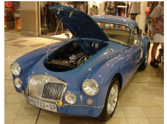
Dave Wheelers' MGA Coupe