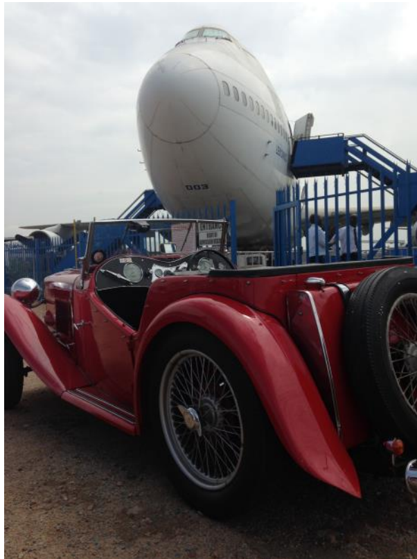
The Mostert's MG TC and the Boeing 747 "Lebombo" at the SAA Museum during the January Run.