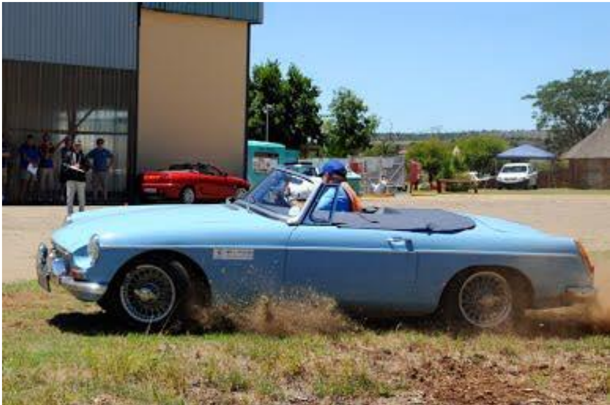
The Westaway 'B in its Natural Habitat