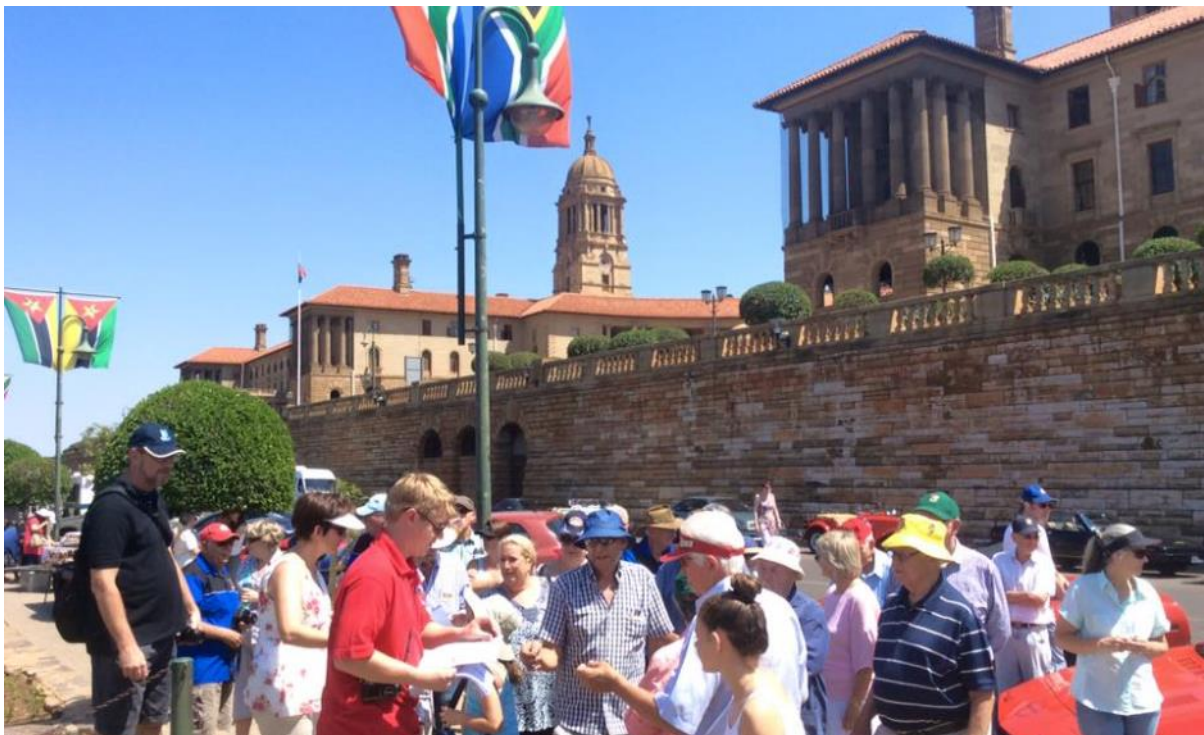
Start of the Jacaranda Run at the Union Buildings