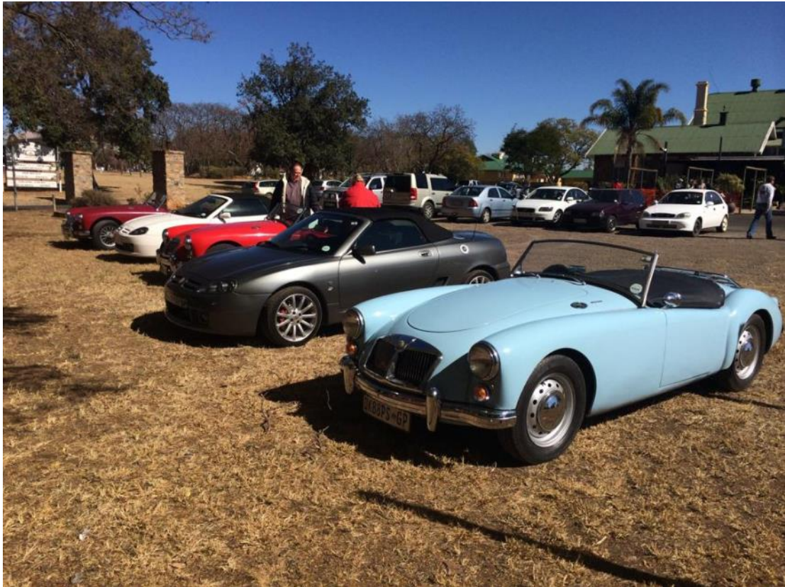
MG's on the "Icicle" run held on 26 July 2015