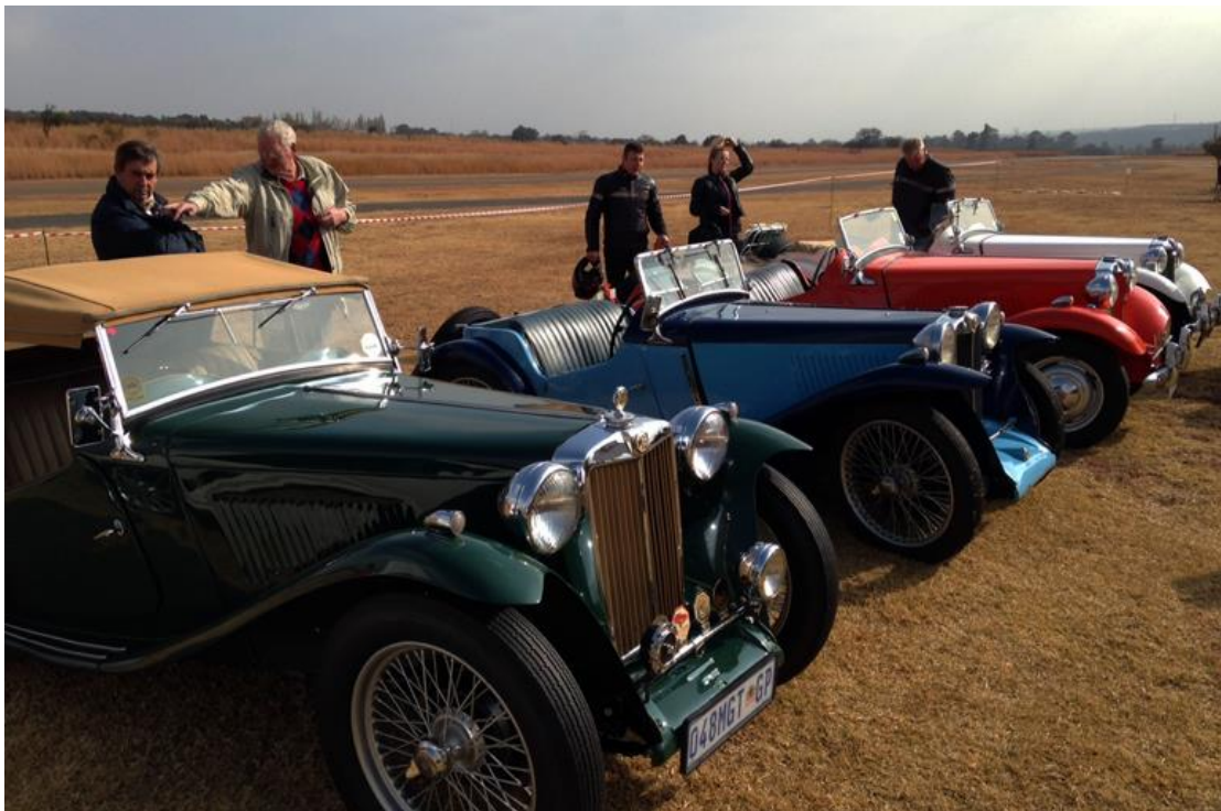
A line up of early MG's at this year's showday held at Kitty Hawk last month