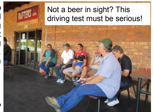
Not a beer in sight? This driving test must be serious!

Drive your MG, even Pepi's PA competed at the driving test, not X-power P-power. Steve