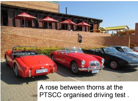
A rose between thorns at the PTSCC organised driving test .

This allowed us to continue with evening and serve up the Bunny Chow of lamb curry or fragrant chicken which seemed well received by those present in the low light, flickering candle, romantic ambience.