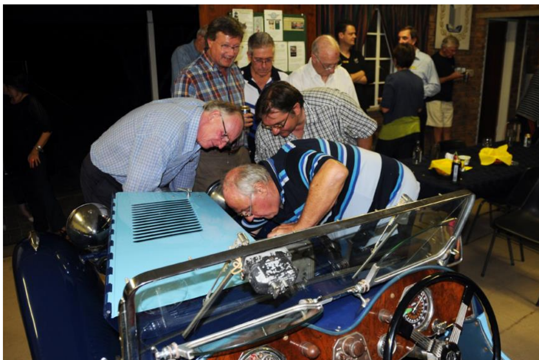
Members come to grips with the details of PA810 at the Pub Evening on Friday 13 March 2015